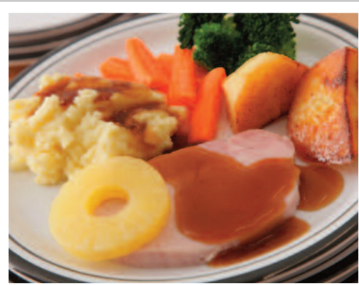
Roast of the Day served with Roast/Mashed Potatoes, Seasonal Vegetables & Gravy