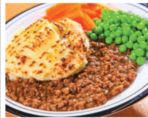
Cottage Pie served with Seasonal Vegetables