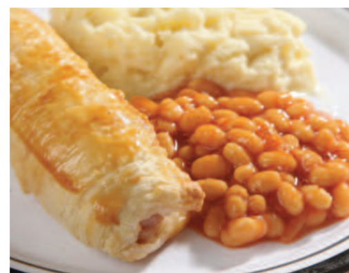
Homemade Sausage Roll served with Mashed Potato & Baked Beans