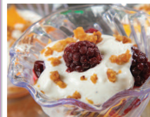
Yoghurt Fruit Crunch