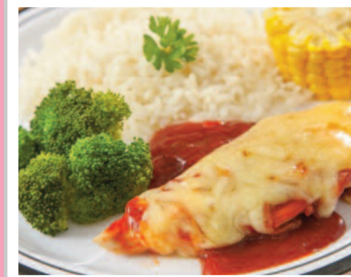
BBQ Chicken served with Rice & Seasonal Vegetables