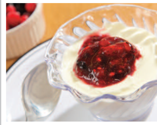
Yoghurt & Fruit Compote