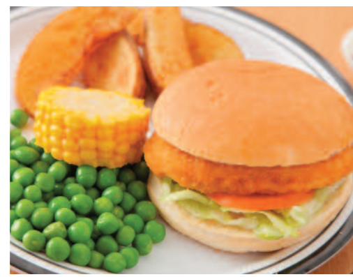
Crispy Chicken Burger served in a Bun with Potato Wedges & Seasonal Vegetables or Baked Beans