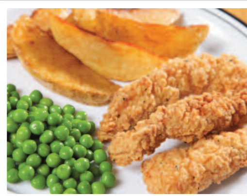
Battered Chicken Strips served with Potato Wedges & Seasonal Vegetables