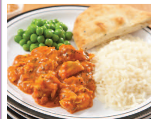
Chicken Tikka Masala served with Rice, Naan Bread & Seasonal Vegetables