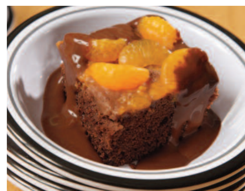
Chocolate Mandarin Sponge & Custard