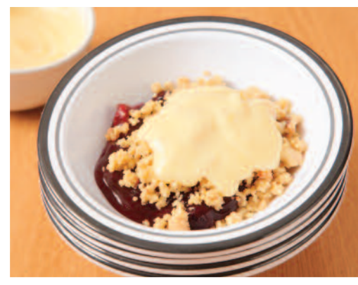
Fruit Crumble & Custard