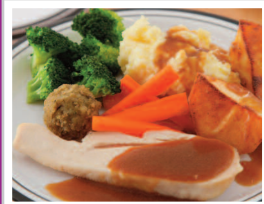
Roast of the Day served with Roast/Mashed Potatoes, Seasonal Vegetables & Gravy