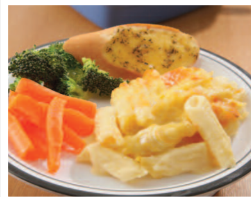
Mac'n'Cheese served with Crusty Bread & Seasonal Vegetables