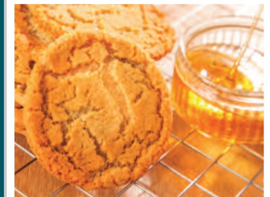
Golden Crunch Cookie