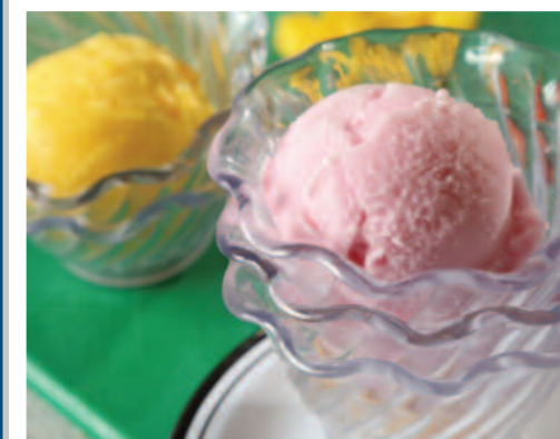
Frozen Fruit Yoghurt