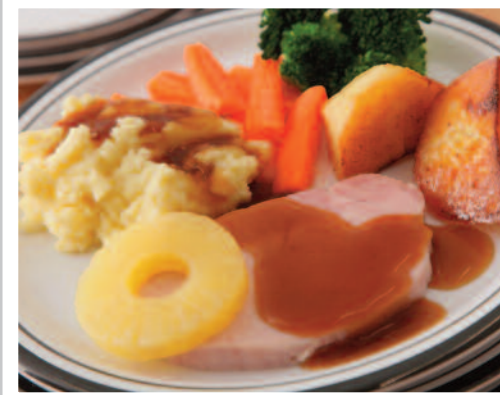
Roast of the Day served with Roast/Mashed Potatoes, Seasonal Vegetables & Gravy