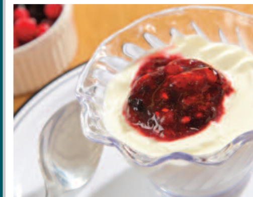
Yoghurt & Fruit Compote