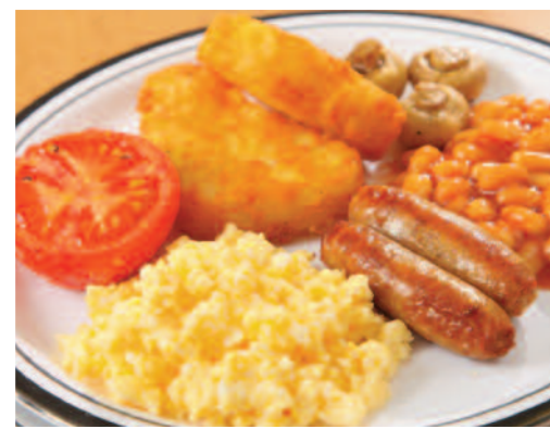
Sausage Brunch served with Scrambled Egg, Hash Browns & Baked Beans