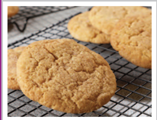
Snicker Doodle Biscuit

Available every day – Unlimited Salad, Freshly Baked Bread, Fruit Yoghurt, Fresh Fruit Platter & Chilled Water. For allergen information, please ask one of our Catering Team. All the above dishes are subject to availability.