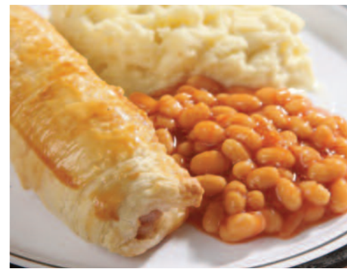
Homemade Sausage Roll served with Mashed Potato & Baked Beans