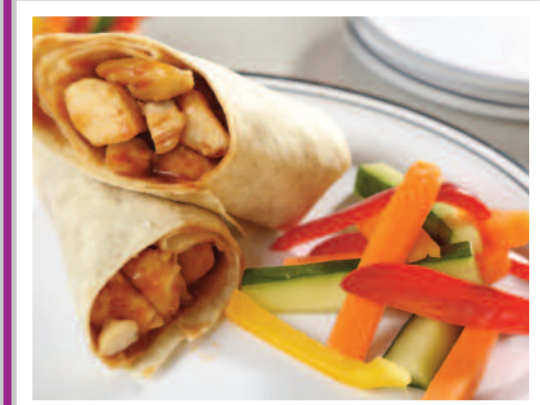
Hot BBQ Chicken Wrap served with Vegetable Sticks or Seasonal Vegetables