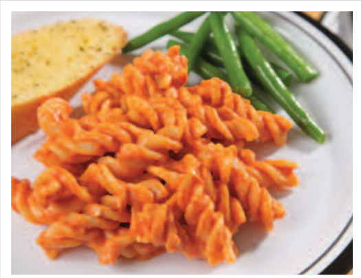
Tomato & Mascarpone Pasta served with Garlic Bread & Seasonal Vegetables