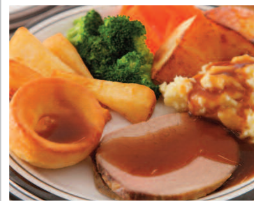
Roast of the Day served with Roast/Mashed Potatoes, Seasonal Vegetables & Gravy