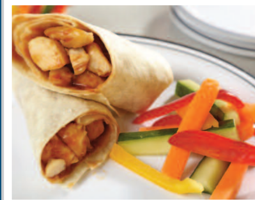
Hot BBQ Chicken Wrap served with Vegetable Sticks or Seasonal Vegetables