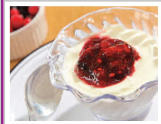
Yoghurt & Fruit Compote