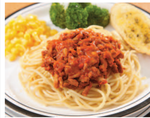
Spaghetti Bolognese (V) served with Garlic Bread & Seasonal Vegetables