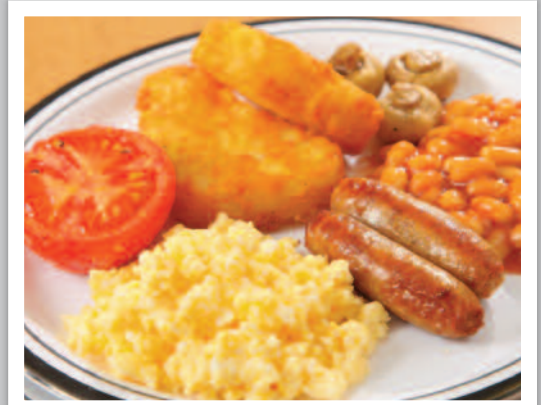
Sausage Brunch served with Scrambled Egg, Hash Browns & Baked Beans